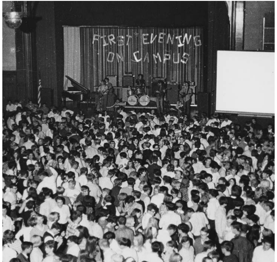
A performance at the IMU, Sept. 1967.

Dance bands and theatre groups were popular events. The Cincinnati Symphony performed. A film series began with popular silent movies that cost 5 cents a ticket to see famous stars such as Charlie Chaplin, Mary Pickford and the vampire Nosferatu. The Union began getting paintings from famous Brown County artist T.C. Steele. That was the beginning of what is now IMU’s extensive art collection.