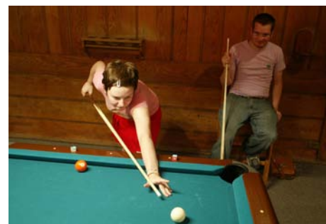
Students play a friendly game of pool at the Union Back Alley.