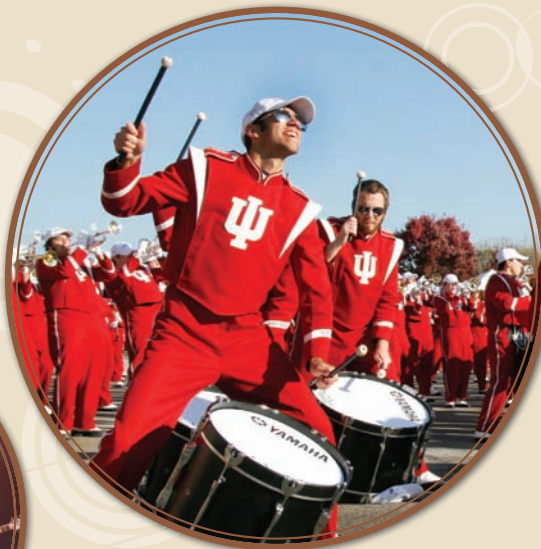
IU HOMECOMING FESTIVITIES