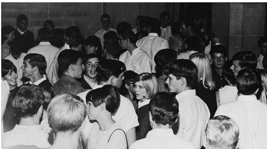
Students gather in the IMU, Sept. 1967.

In 1909, Whittenberger returned to IU and found rivalries between freshmen and sophomores and fraternity members and independent students had turned the fall semester into brawling adventures better suited for bare-knuckle fights.