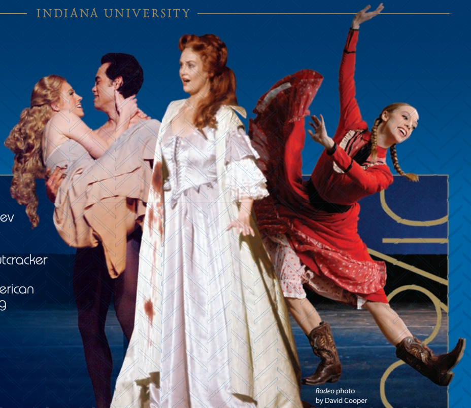
Rodeo