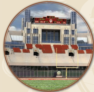
NORTH END ZONE DEDICATION CEREMONY