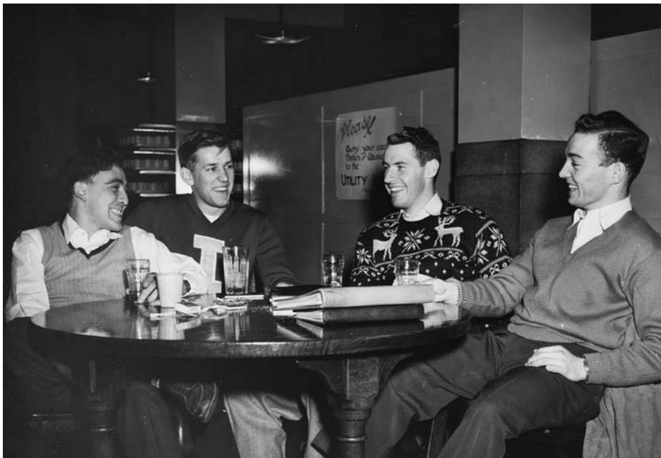
Young men enjoy the IMU, 1945.