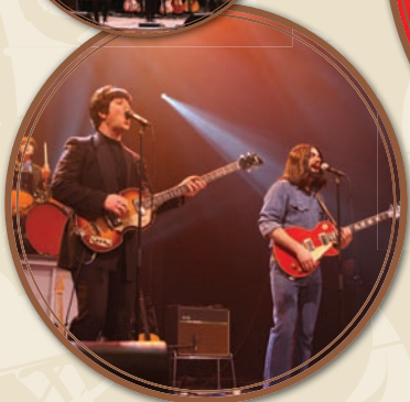
BEATLES TRIBUTE AND OTHER GREAT PERFORMANCES