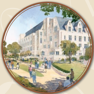
MULTIDISCIPLINARY SCIENCE II BUILDING DEDICATION CEREMONY