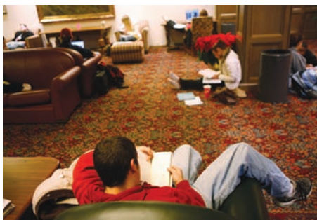
Students cram for finals in the IMU.